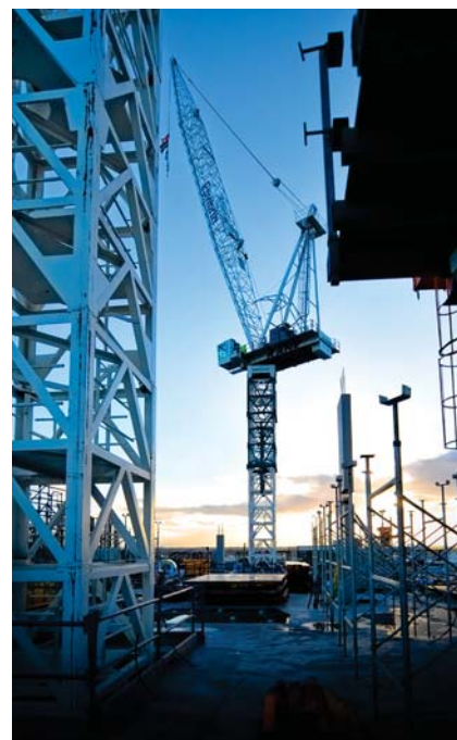
The second tower crane at the worksite for the Epworth Richmond Hospital redevelopment project by Kane Constructions

The Epworth Richmond redevelopment has been designed to respond to patient, doctor and staff expectations and to meet the needs of the 21st century—setting a new standard in health facilities and patient care. The project is worth $120 million and services will be built within a new