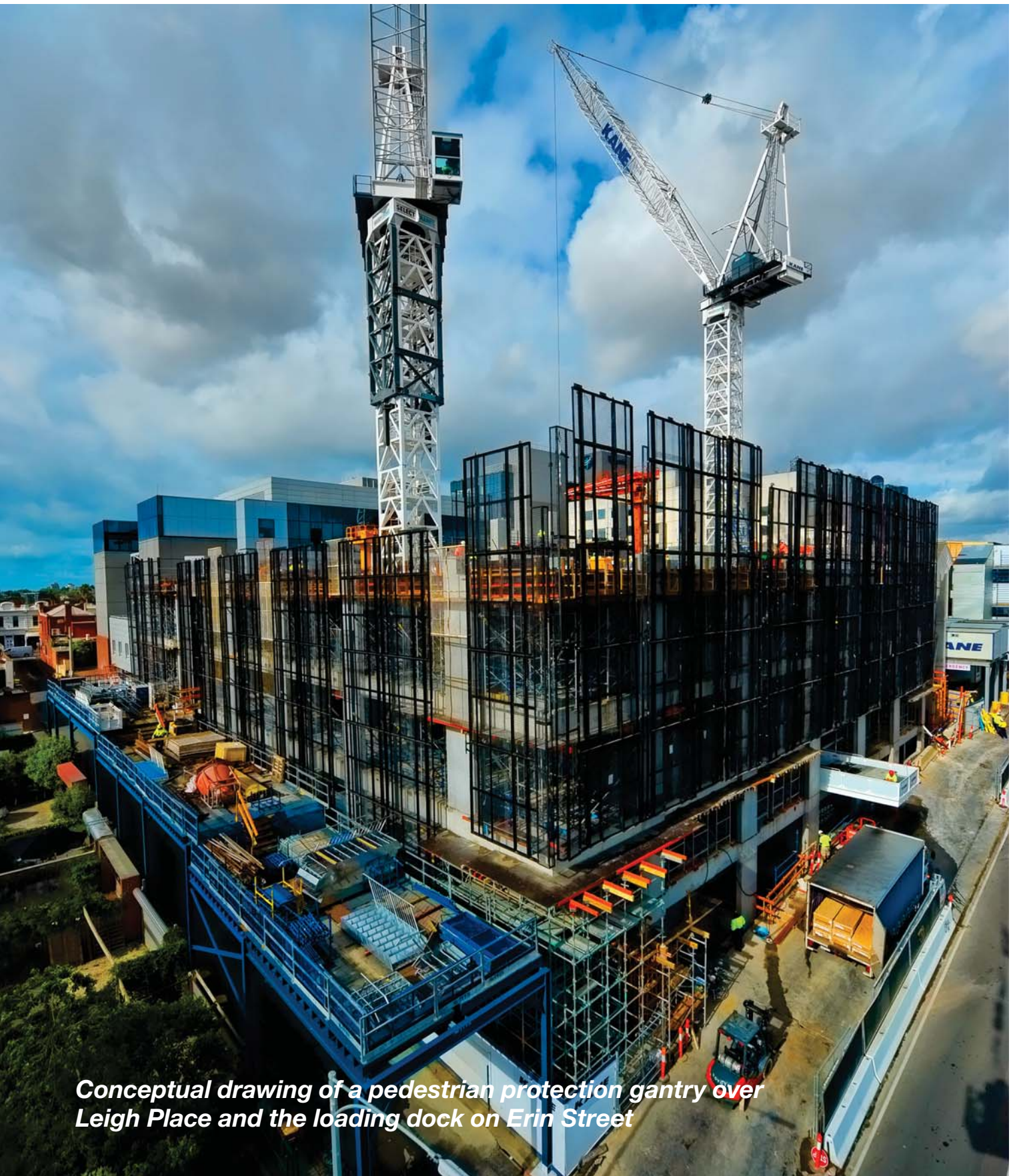
Conceptual drawing of a pedestrian protection gantry over Leigh Place and the loading dock on Erin Street